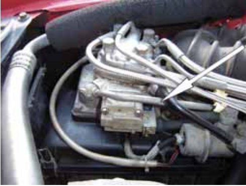
Location in Golf/Jetta CIS-E

There are two different differential pressure regulators (DPR) for CIS-E cars. The CIS-E systems used a light gray DPR and the CIS-E Motronic ('90-'92 2.0L) used a dark gray DPR. This mod applies to both.